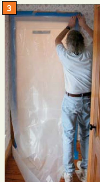
3 A second sheet of plastic covers the first, but it is taped only to the head casing so that it can hang loosely over the doorway.