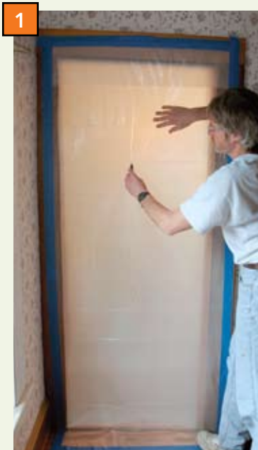
1 After taping all sides of the plastic, cut a slit down the middle, stopping 6 in. short of the top and bottom.