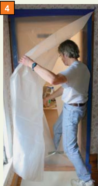
4 Trim the excess plastic off the bottom of the second sheet of plastic where it meets the floor, and the homemade airlock is complete.