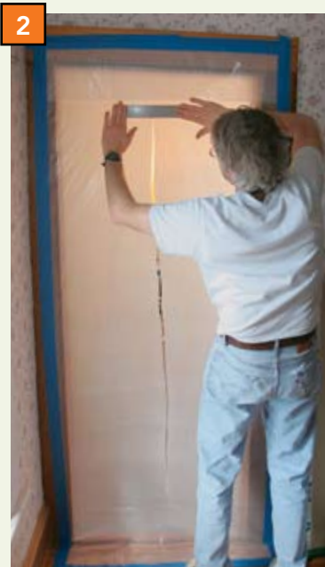
2 Apply strips of duct tape to reinforce the slit in the plastic, and keep it from widening as you walk in and out through the airlock.